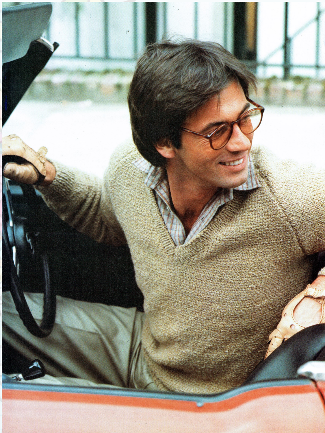
Vintage 70s Tunisian Stitch Crochet Pattern Men's V-Neck Pullover Jumper Sweater Chest 36-40 Inches