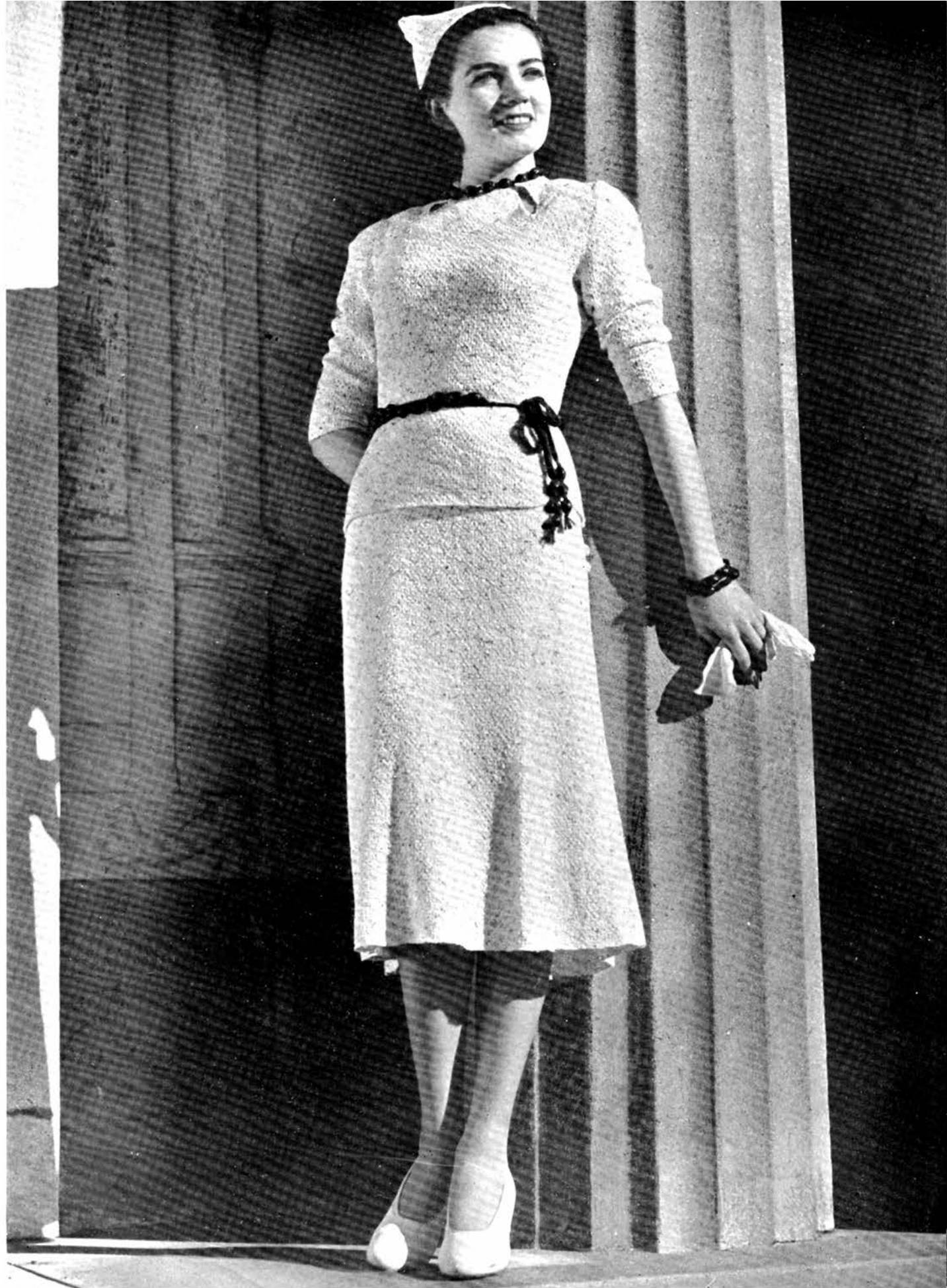
STYLE NO. 1124 — Of BERNAT'S newest yarn — "Florelle" — is this two-piece handknit. Be sure to make the pert little hat to go with it, and use wooden cap beads for ultra-smart trim!