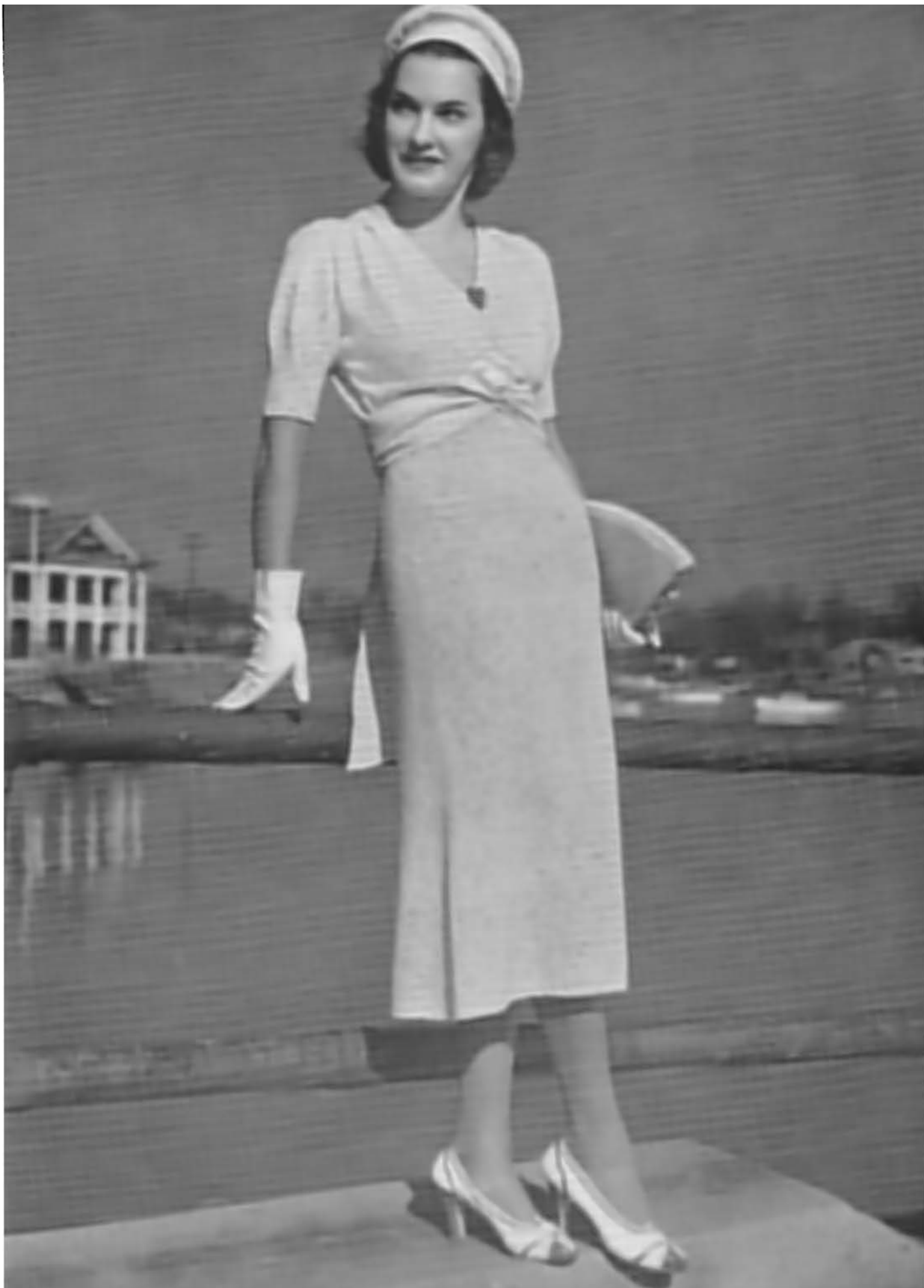
STYLE NO. 1110— An entirely new and ever so nice design makes its début in this one-piece dress of BERNAT'S Florelle yarn. You achieve that sculptured look with a separate sash!