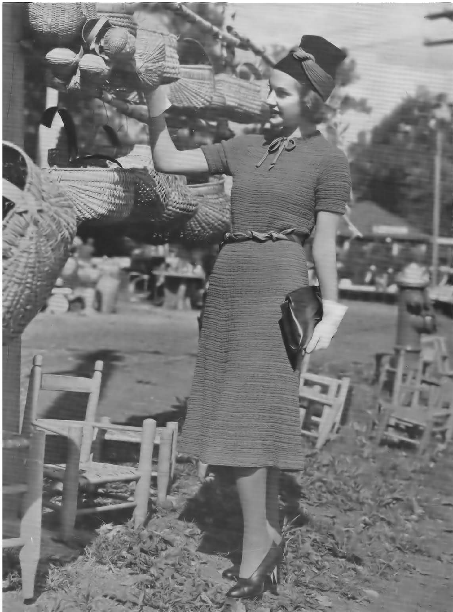
STYLE NO. 1111 — There's subtle glamour in this one-piece dress of BERNAT'S Chantilly yarn. Fits like your skin and has one of those softly flaring skirts.