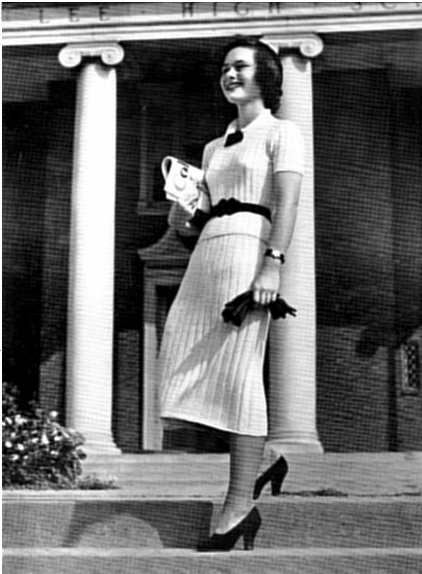
STYLE NO. 1112 —BERNAT'S popular Snowflake comes into its own in this smartly tailored two-piece. You'll want to knit more than one of these dresses, for the design is right for so many occasions.