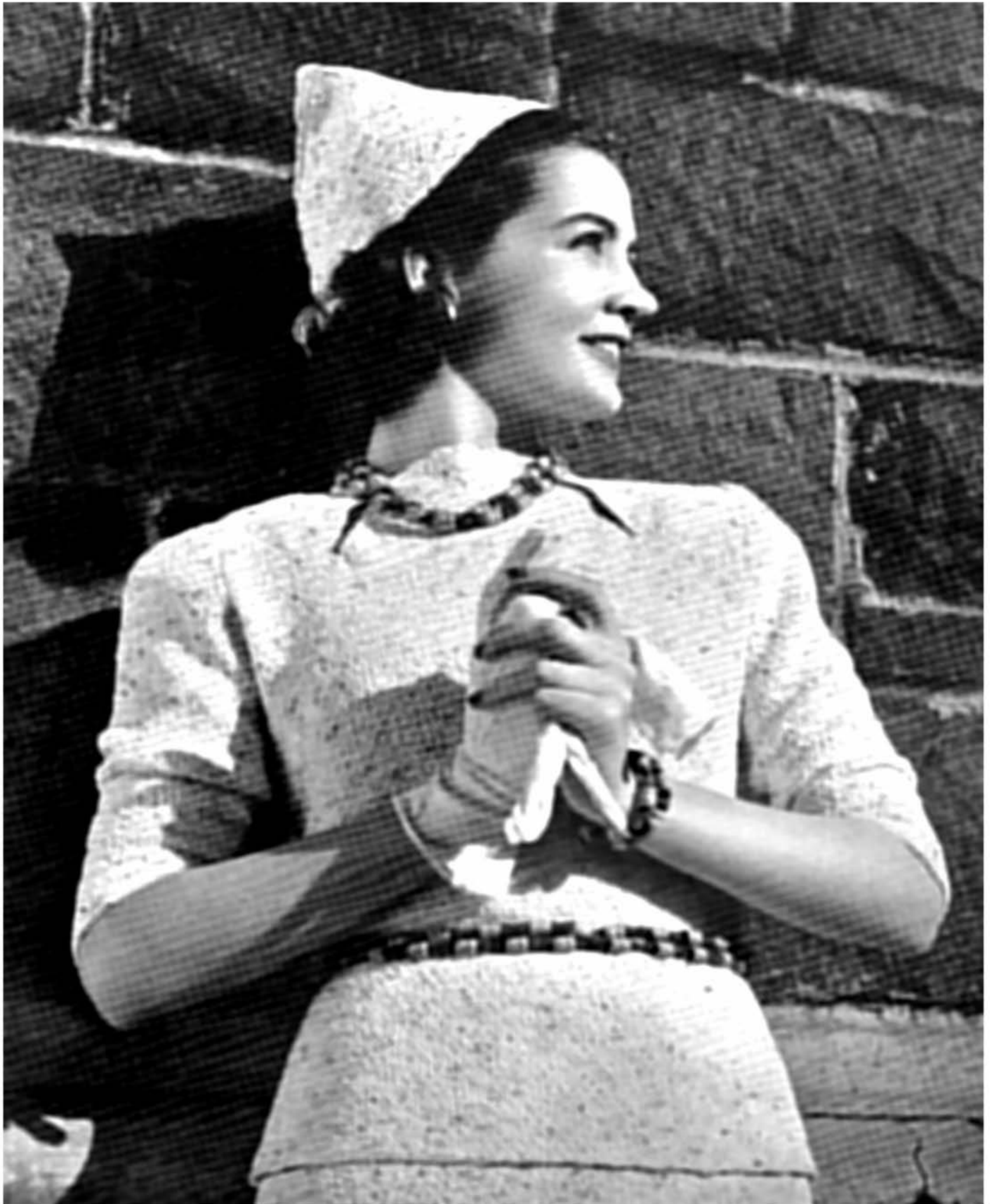
STYLE NO. 1121 — Changing the accessories from the cap beads to the acorn beads adds a new interest to this two-piece dress of BERNAT'S Florelle.