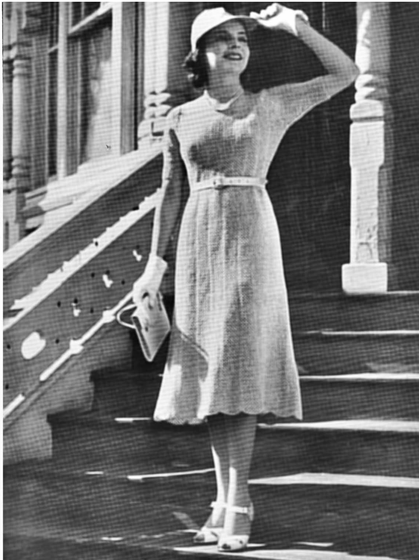
STYLE NO. 1115 — Did you ever dream a crochet hook could turn out a dress as charming as this! It's an exclusive BERNAT design to be crocheted of BERNAT'S new Chantilly yarn.