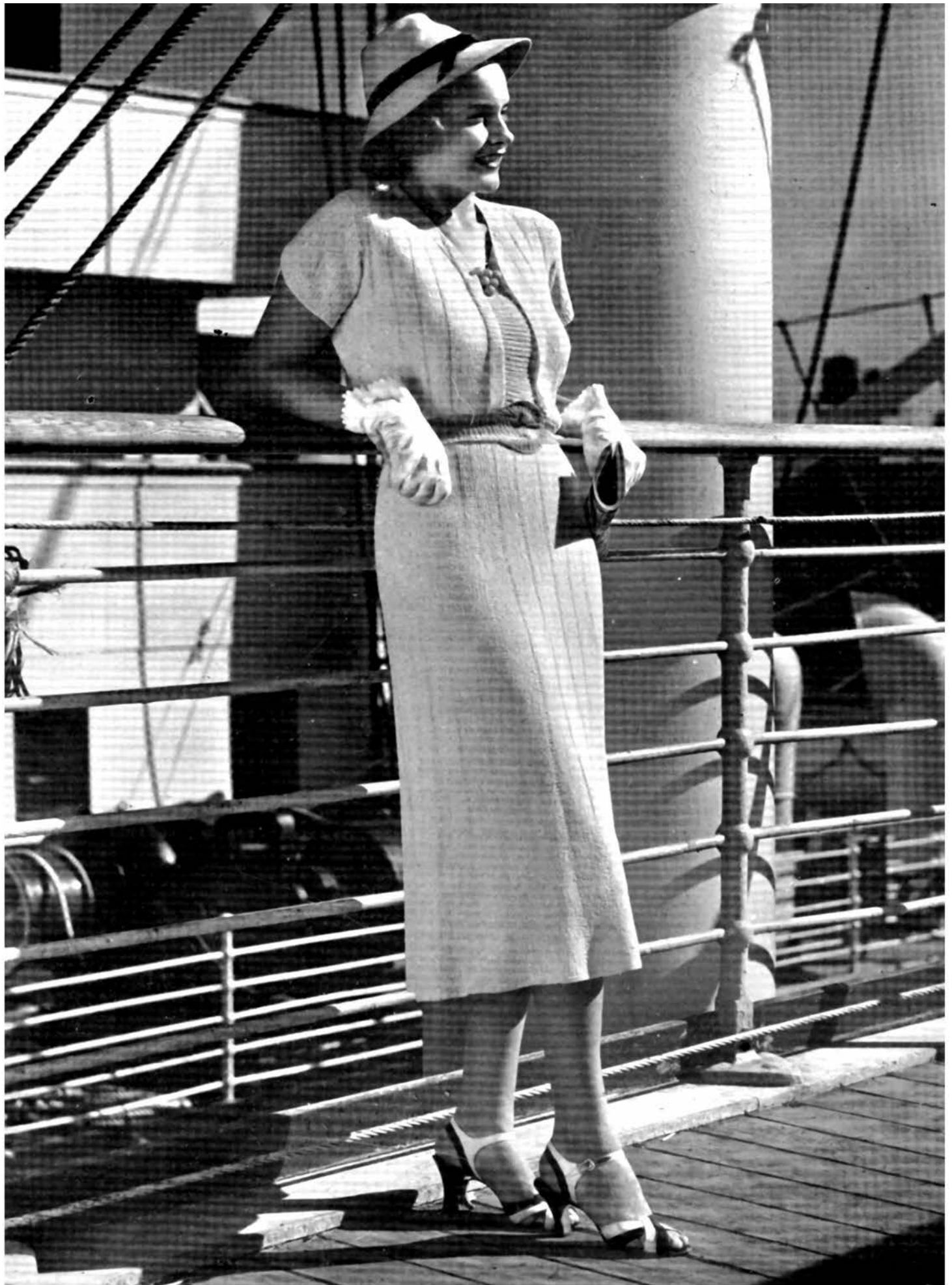
STYLE NO. 1068 — A one-piece dress with a vestee front. It's all worked out with BERNAT'S lovely Veltine yarn and is the perfect dressy sports costume.