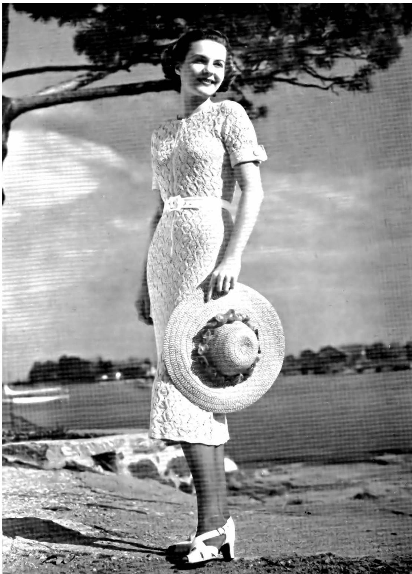
STYLE NO. 1119— All cotton and all Kool Knit is this one-piece outfit. The pattern works up quickly and is lacy and flattering. You zip up the front!