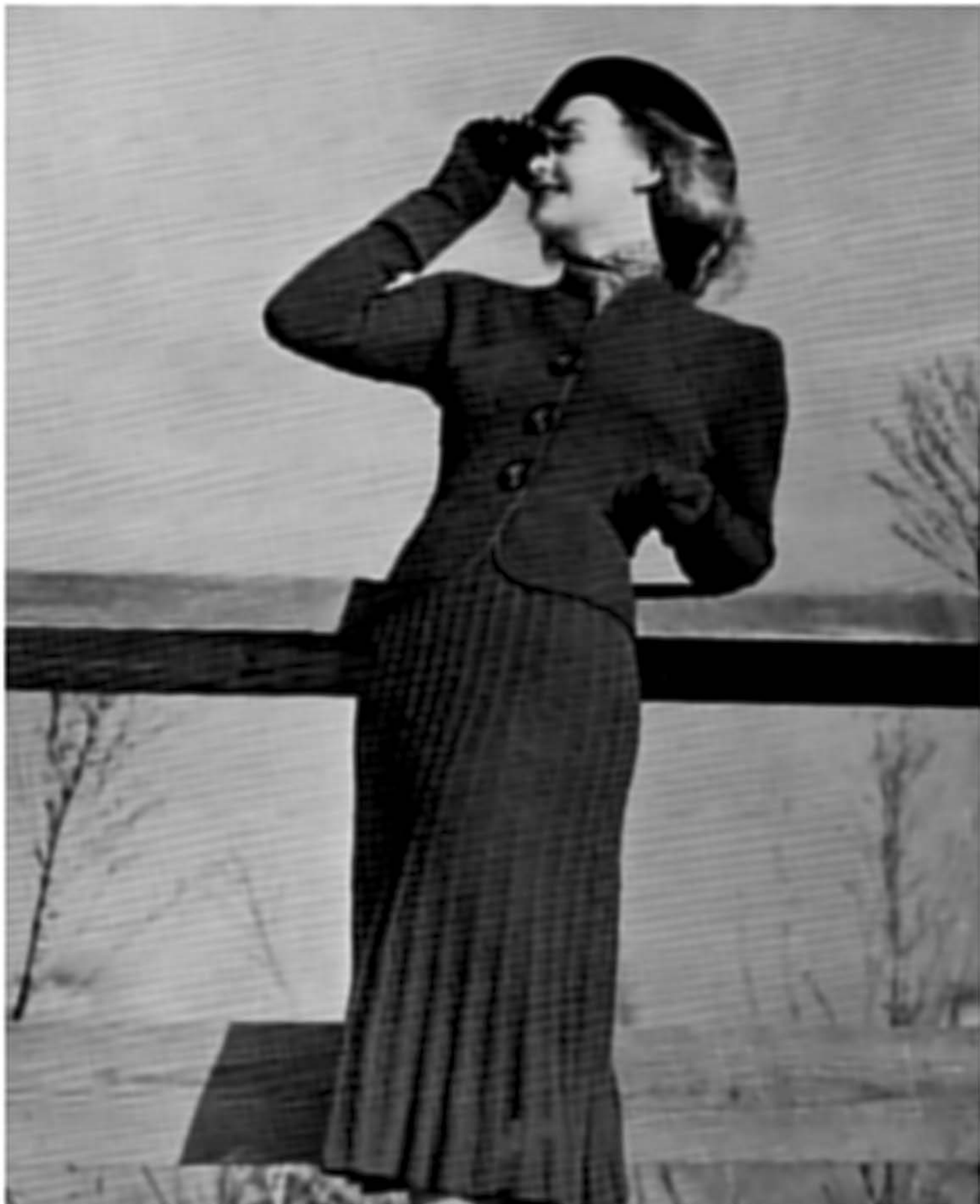
STYLE NO. 1088 — There's swing to the skirt and style galore in the jacket of this two-piece handknit. BERNAT'S Leemont is the yarn used so successfully.