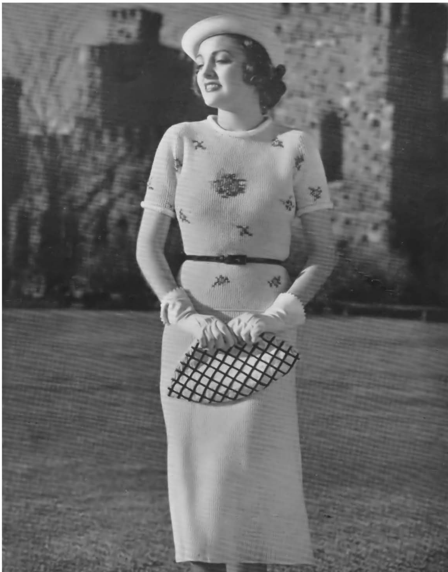
STYLE NO. 1123— A white handknit goes colorful with cross-stitch! This two-piece is knit of BERNAT'S Glendown and its plain design makes it a perfect background for the decorative stitches!