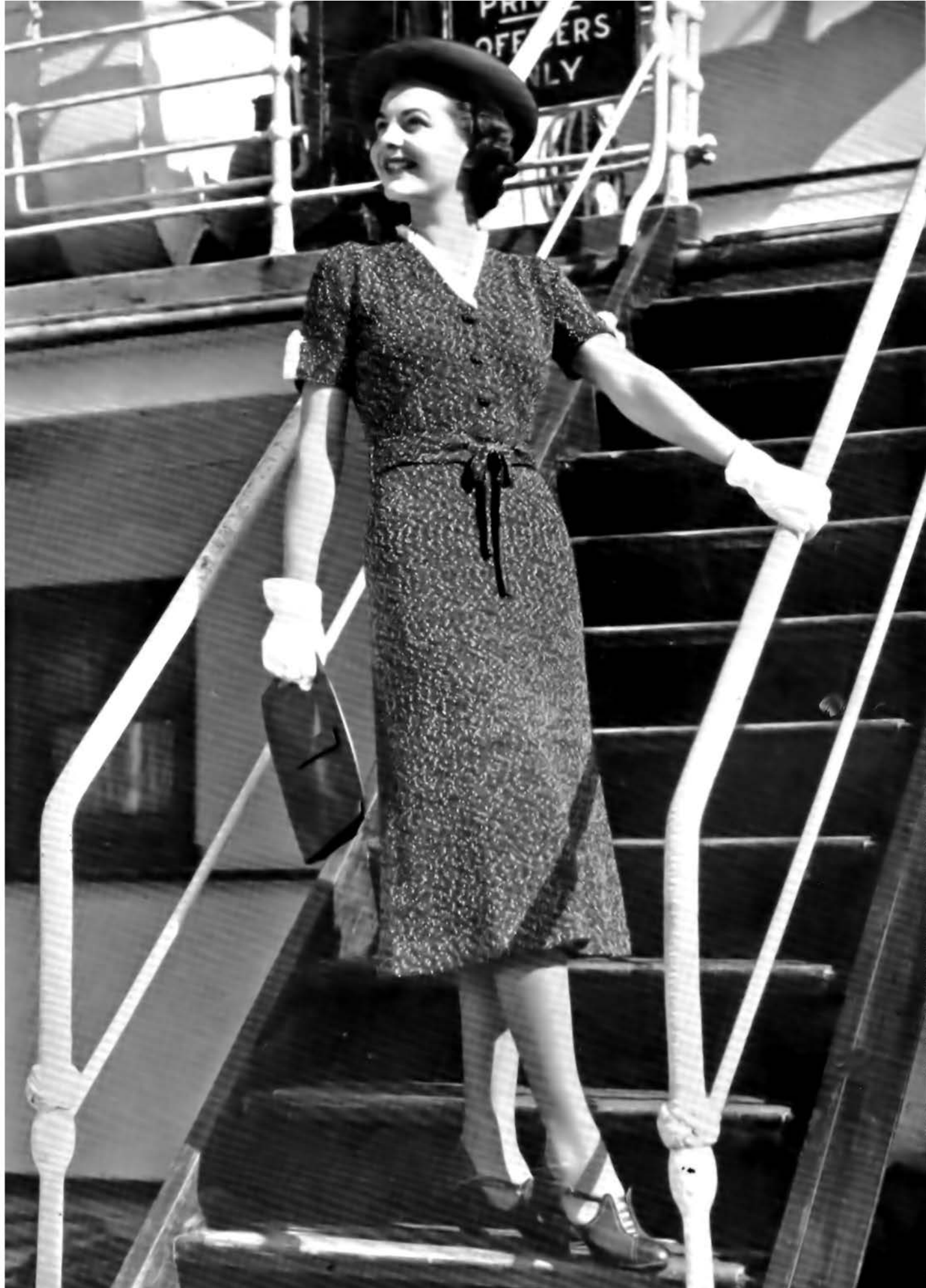
STYLE NO. 1105 — Any woman would have a bon voyage in this classic one-piece dress of BERNAT'S Snowflake. A nice dress for street or business, too.