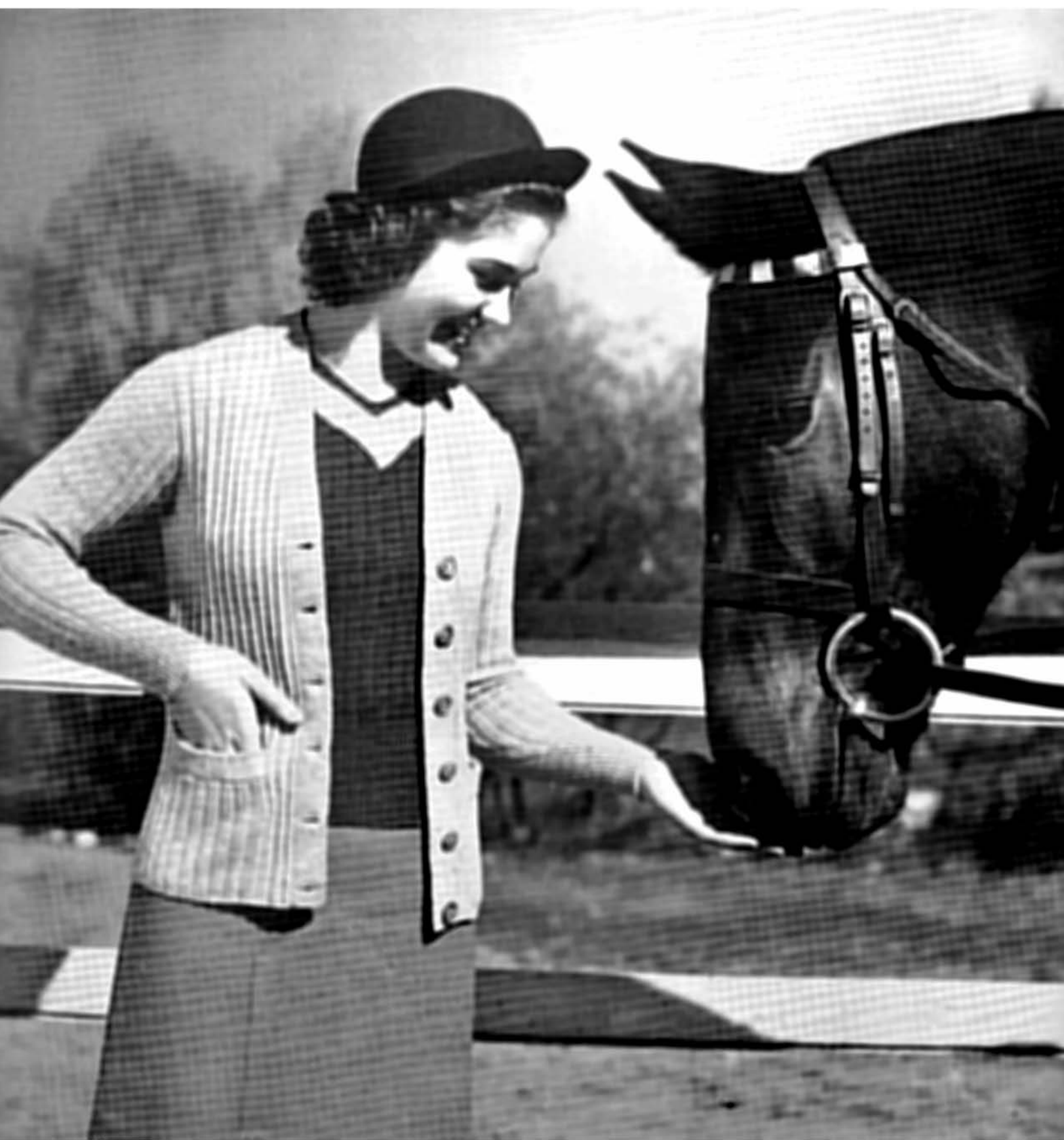
STYLE NO. 181 —A pair of thoroughbreds! The slip-on sweater is knit of BERNAT'S Glendown Heather in ox-blood. The cardigan is of the same yarn but in beige, which also trims the neck of the pull-over.