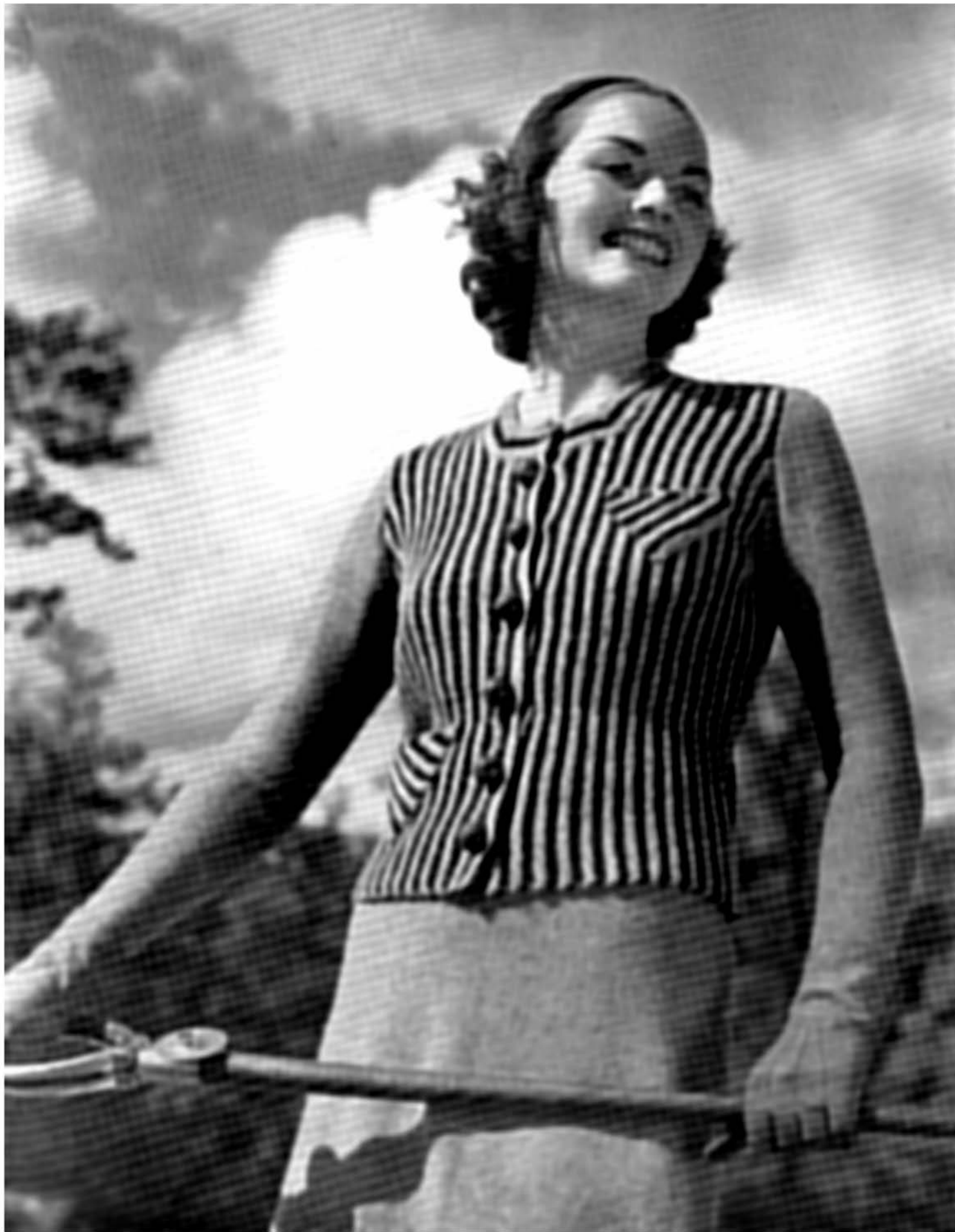
STYLE NO. 1108 —Here's the perfect ensemble for the Great Outdoor enthusiast. A warm sweater with stripes, making it important from a style angle. Of two grand yarns: BERNAT'S Fantasie and Manchu.