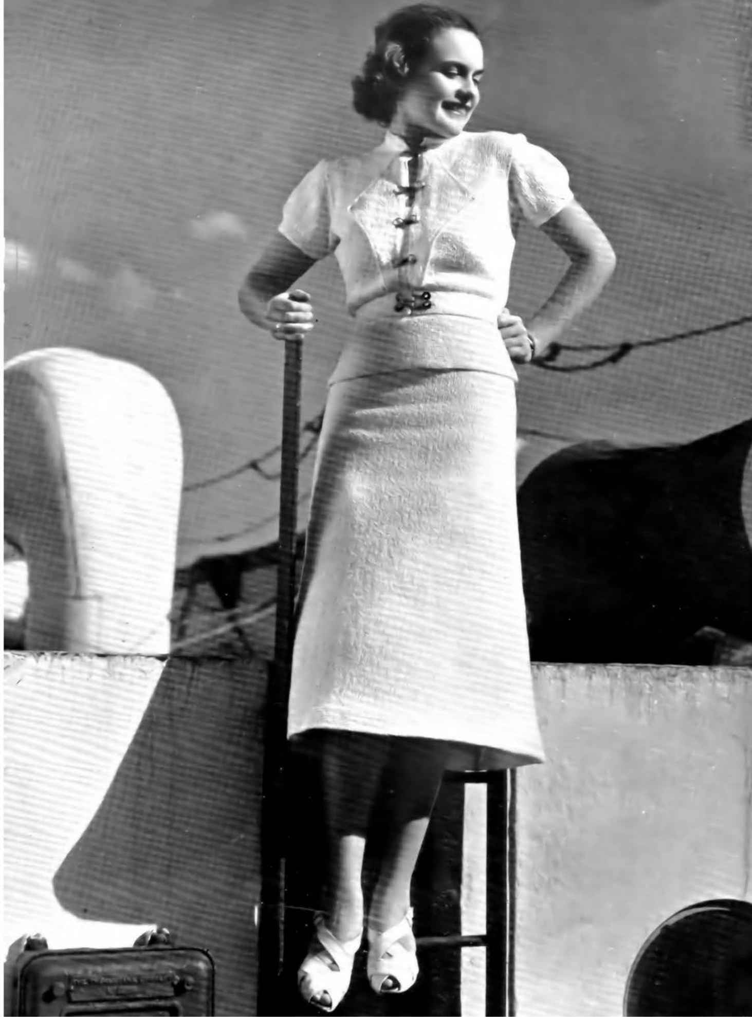
STYLE NO. 1101— A cotton handknit is always nice for warm days. Especially when it's as smart as this and is knit of BERNAT'S Kool Knit.