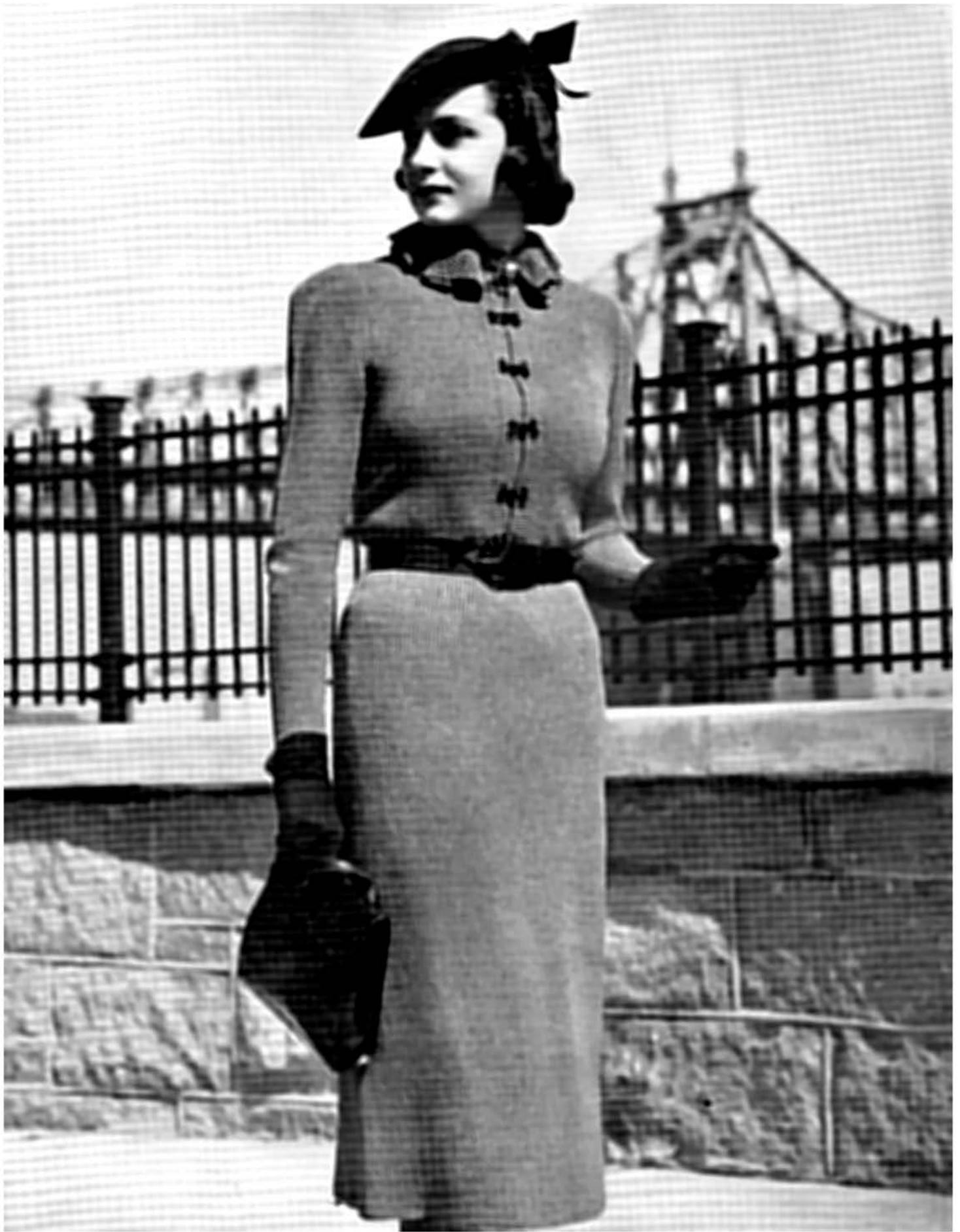
STYLE NO. 1082 — Lovely rich Veltine yarn by BERNAT turns a simple one-piece dress into a masterpiece. The hook-and-eye fasteners are very French, as is the frill at the neck.