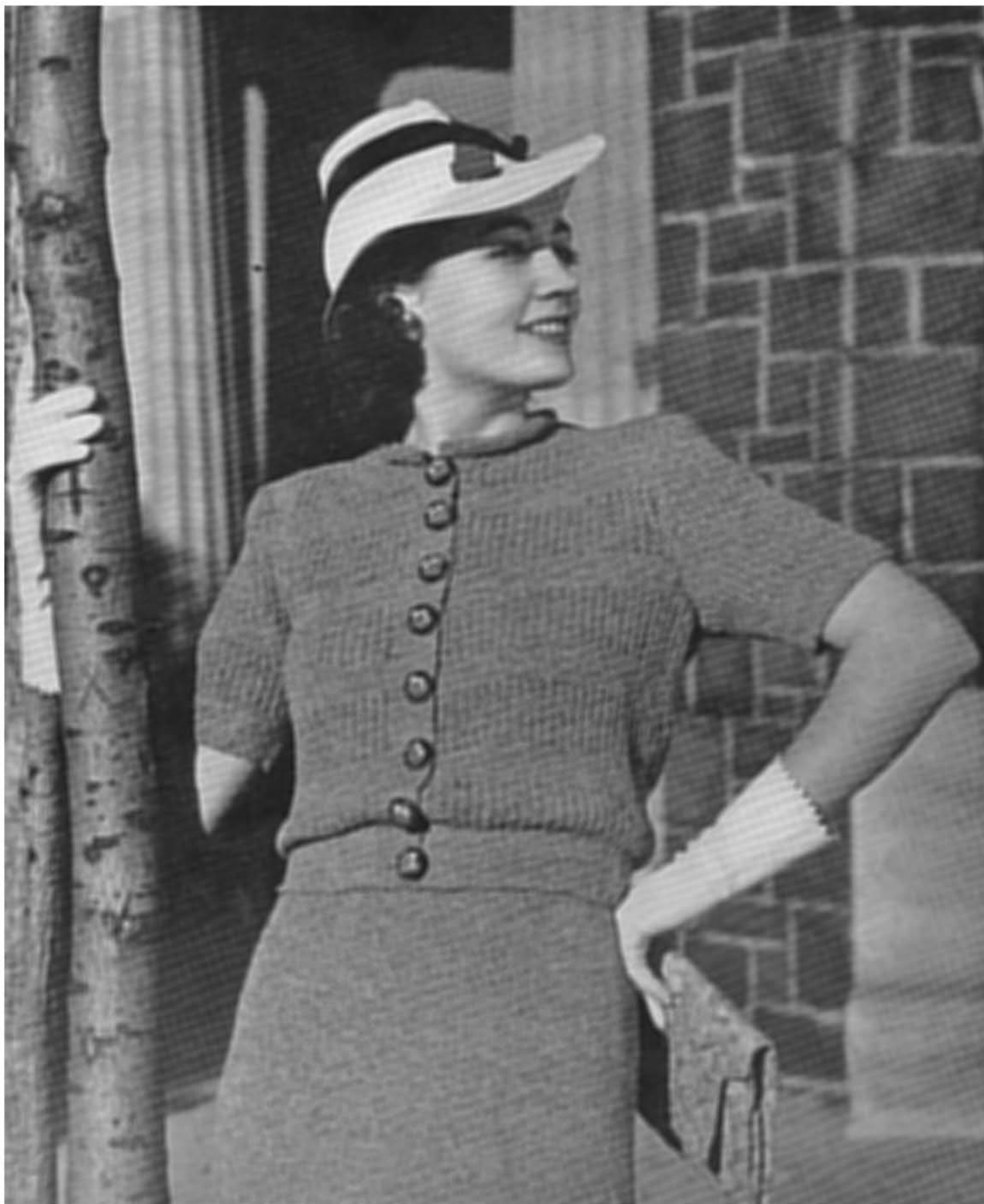
STYLE NO. 1121— A dignified two-piece suit of BERNAT'S very lovely yarn, "Celtaline." This is an excellent suit for town or business wear, and knits up quickly.