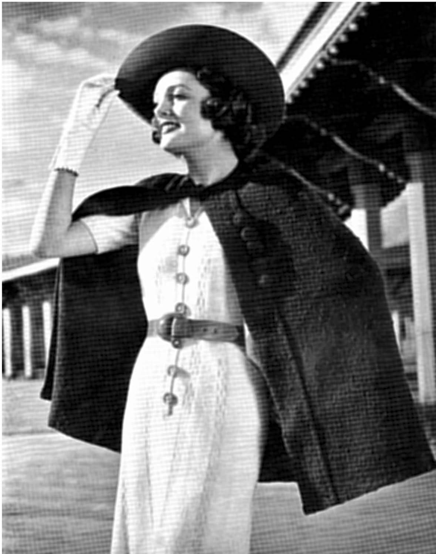
STYLE NO. 1103— A charming one-piece dress adds a cape for extra style measure! The dress is knit of BERNAT'S Yorkshire yarn, while the cape is of BERNAT'S Brittany.