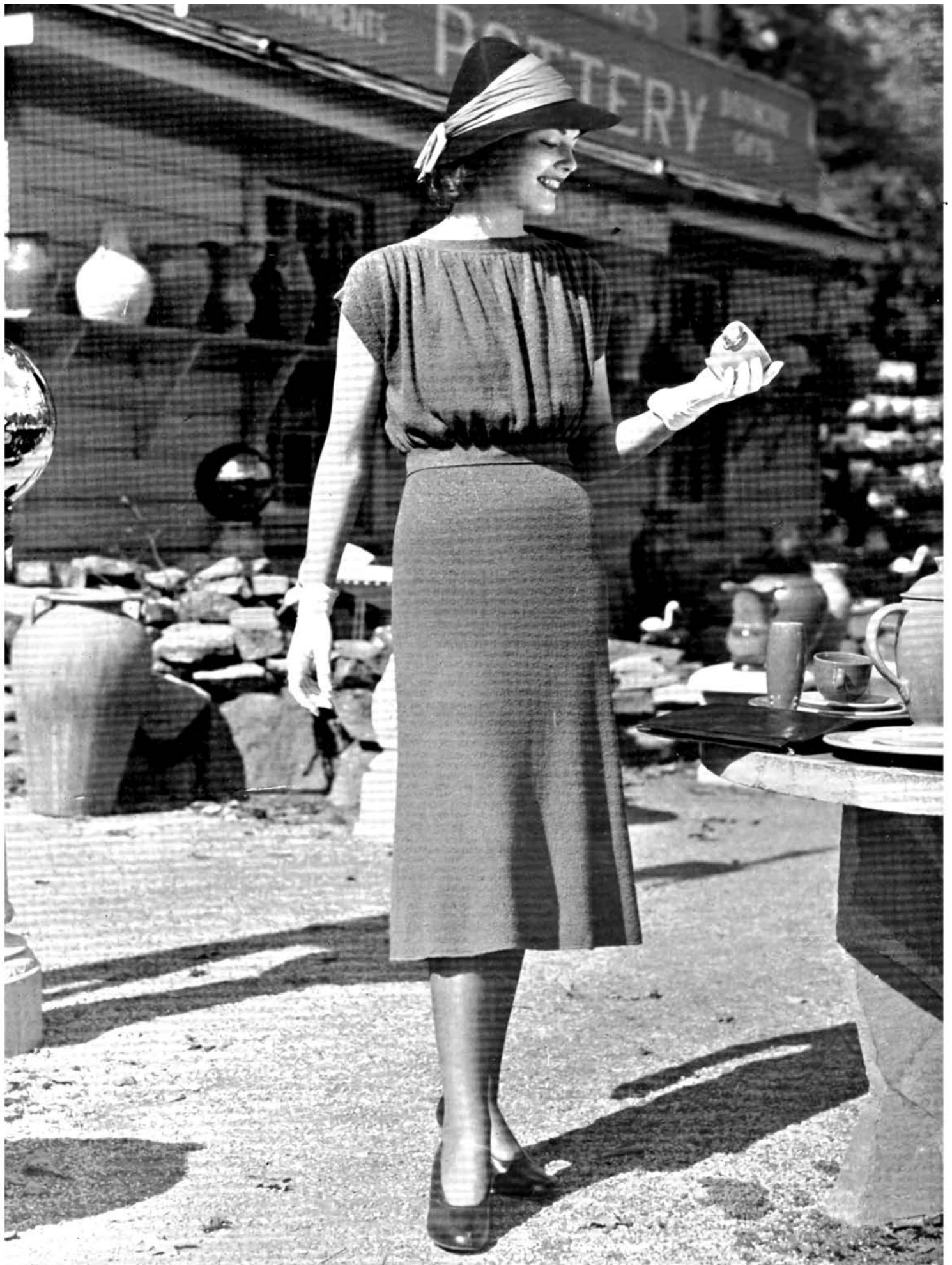
STYLE NO. 1106 — The young lady reading the tea cup wears a handknit of BERNAT'S Bouclé de Laine. This yarn drapes superbly, making it soft and flattering.