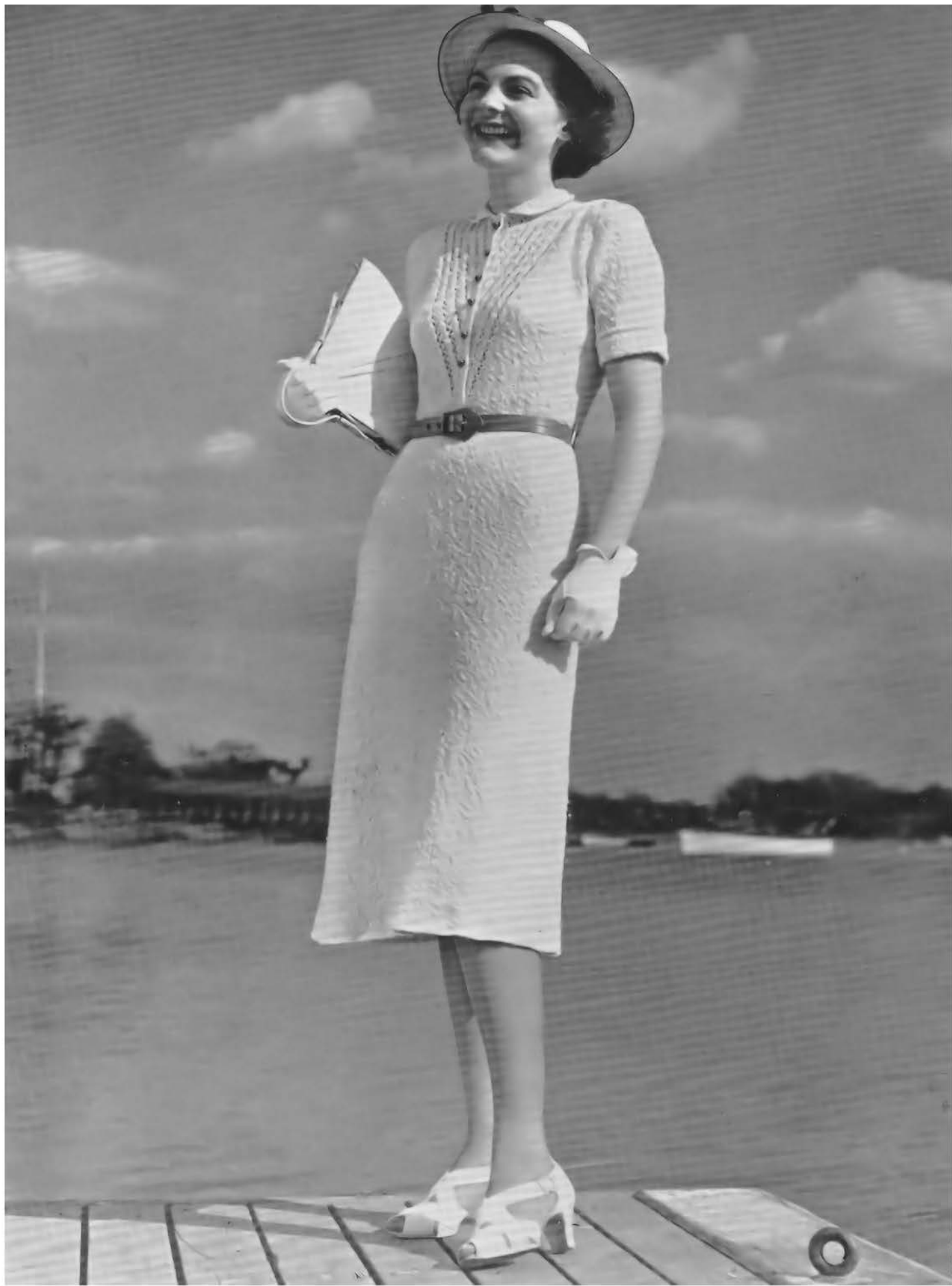
STYLE NO. 1093— BERNAT'S Blossom yarn is lovelier than ever in a very plain, very sophisticated one-piece dress. Perfect for Spring and Summer days when you want to look your best.