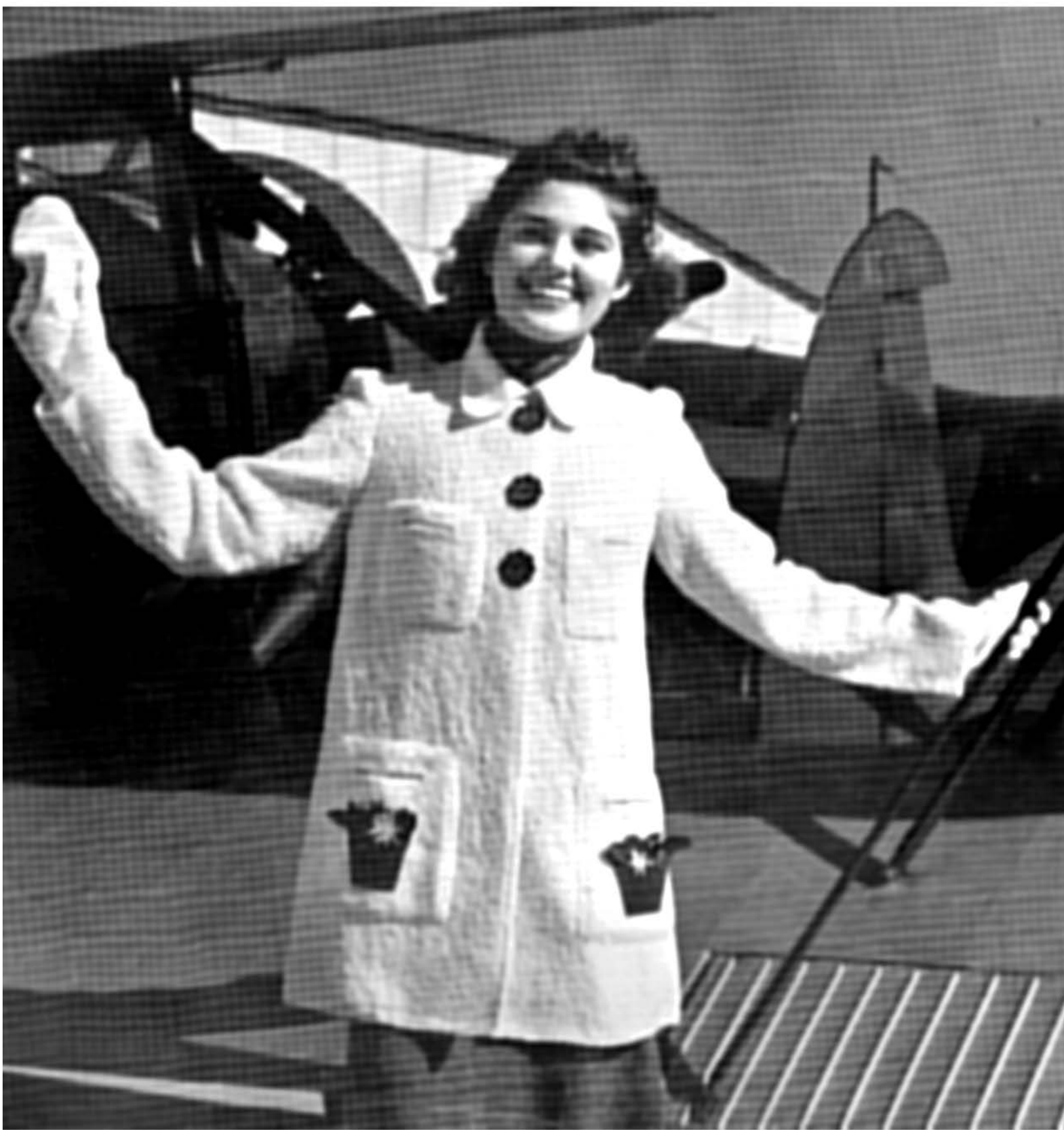
STYLE NO. 1111 — A real swagger coat knit of BERNAT'S Burma Coat yarn. There are four pockets in all, and two of them boast suède flower pots. Very new . . . very smart.