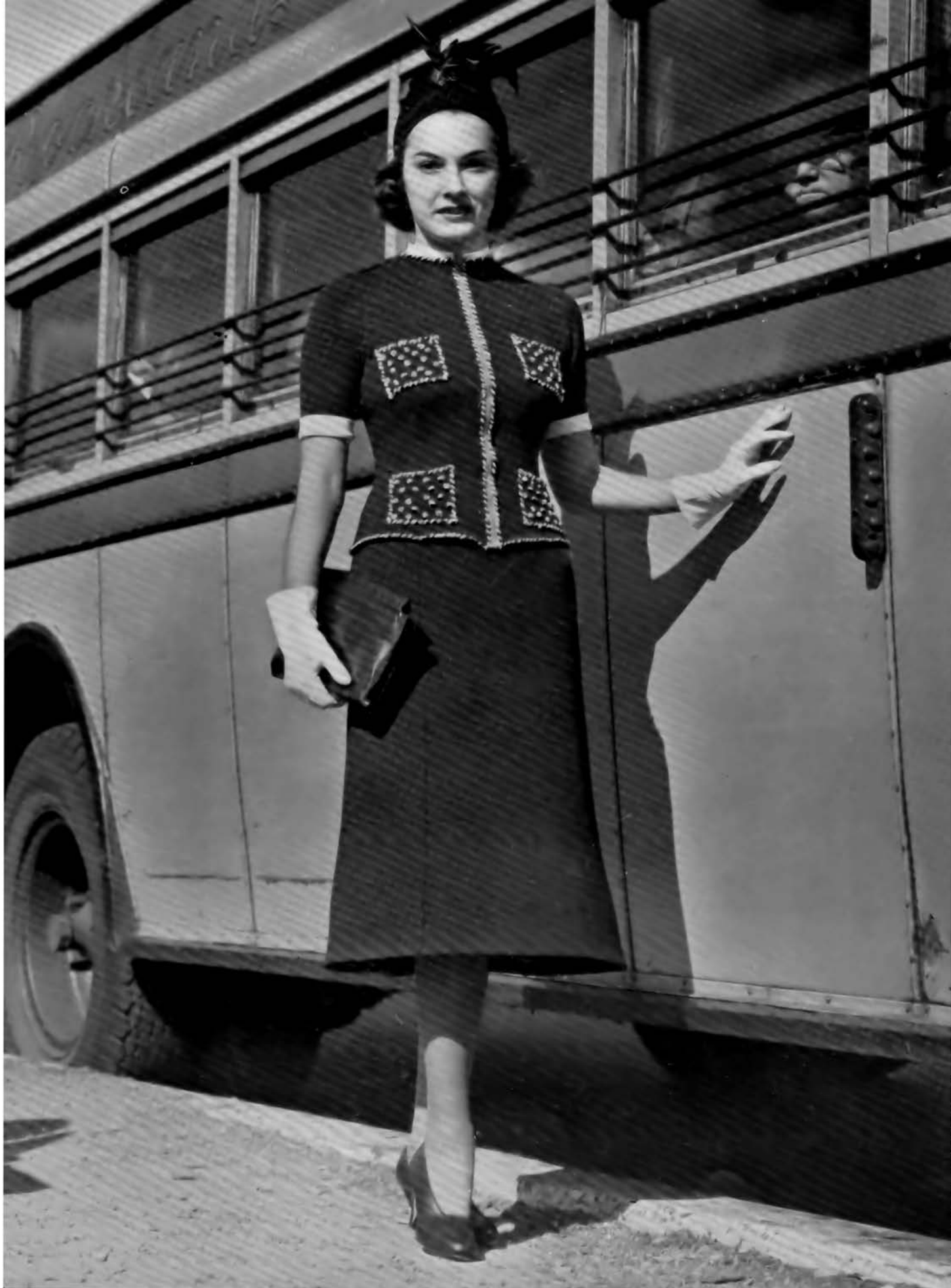
STYLE NO. 1107 —Two-piece suits can be exciting! We prove it by flaring the skirt, putting a zipper up the front of the jacket and adding four patch pockets. Of BERNAT'S Bouclé de Laine with Shetland trim.